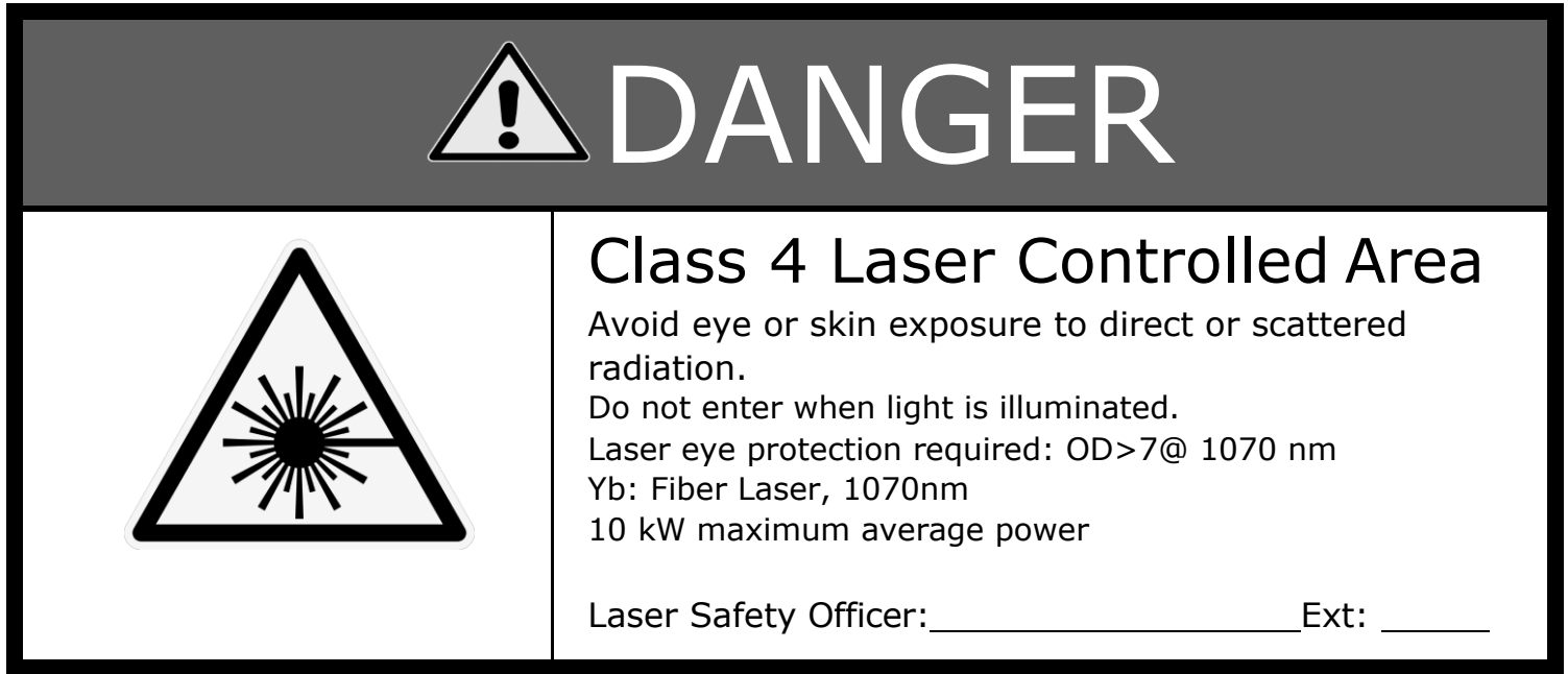
Figure: 25 TAC §289.301(u)(3)(A)(iv)